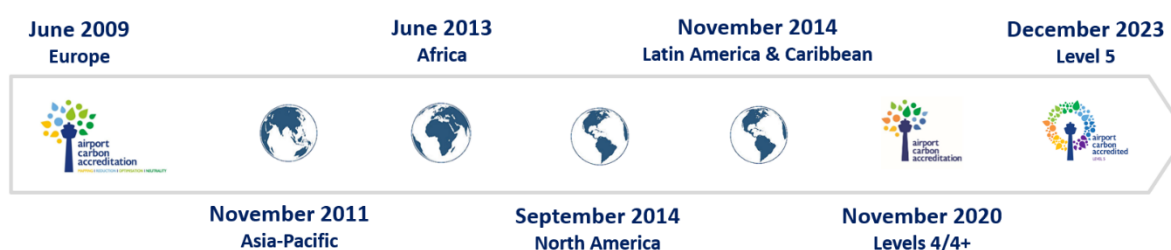
Figure 1 - Airport Carbon Accreditation Milestones

The aim of Airport Carbon Accreditation is to encourage and enable airports to implement best practices in carbon management and achieve emissions reductions. Accreditation provides the opportunity for airports to gain public recognition for their achievements, promotes efficiency improvements, encourages knowledge transfer, raises an airport's profile & credibility, encourages standardisation, and increases awareness and specialisation.