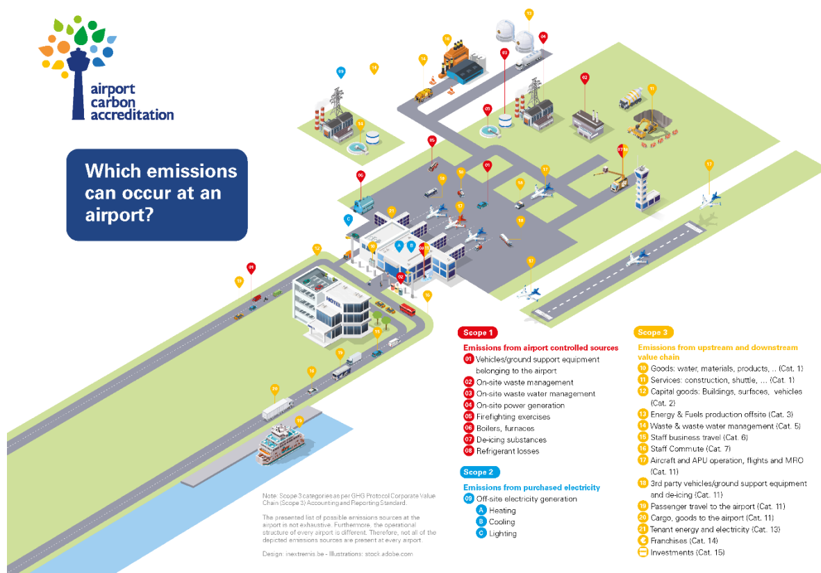
Figure 5 – Sample Overview of Scopes

Scope 1: Direct GHG emissions that occur from sources that are owned and/or controlled by the airport, for example, emissions from combustion in owned or controlled boilers, furnaces, vehicles, etc. or processes.